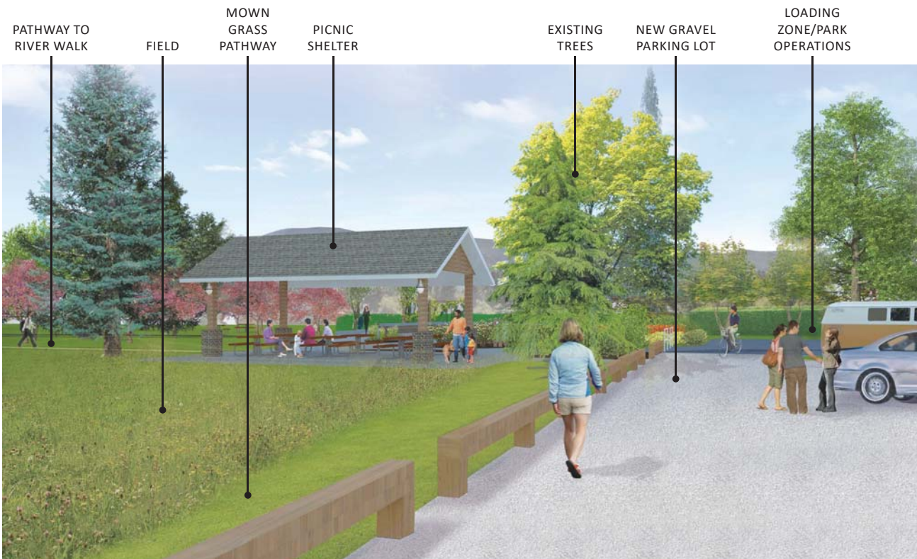
Picnic Shelter and Field (looking west)