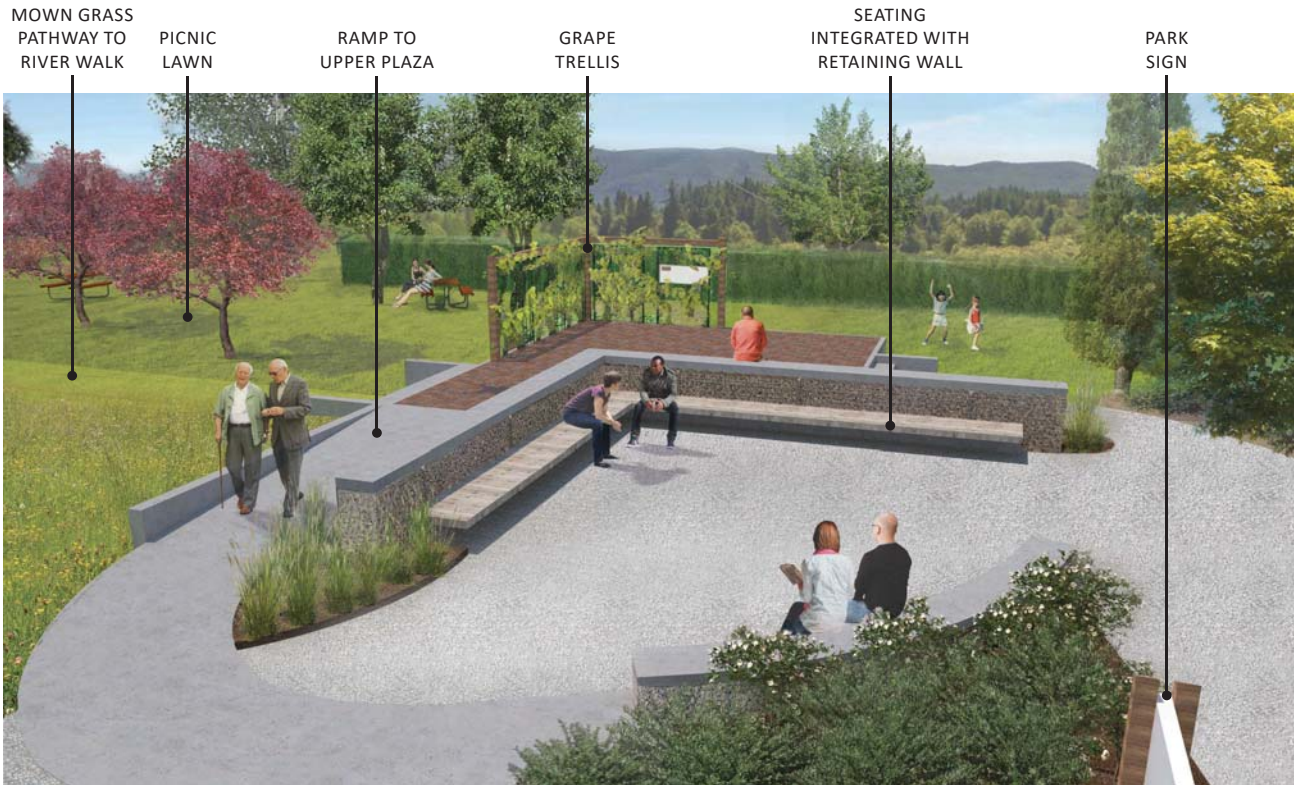
Main Activity Area (looking west)