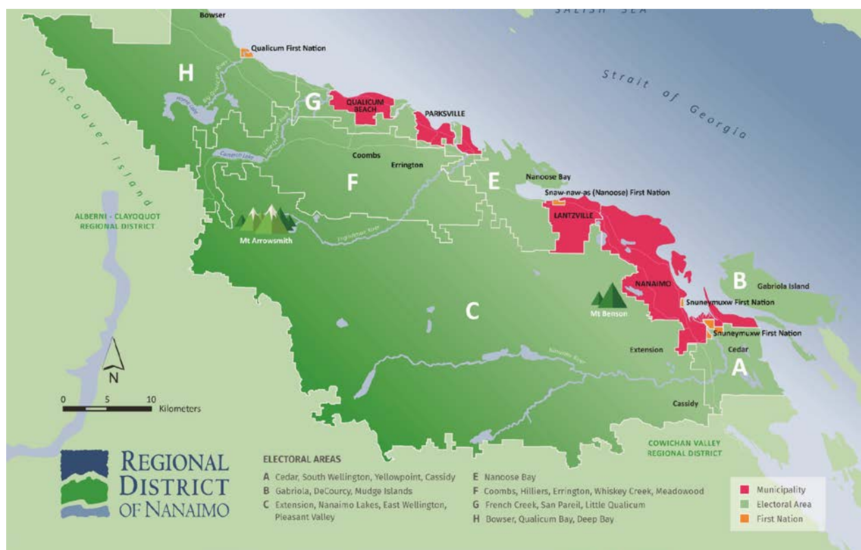
Figure 1. Communities in the Regional District of Nanaimo

The Regional District of Nanaimo (RDN) provides regional governance and services to 170,000 people on the central east coast of Vancouver Island. Communities in the RDN include the municipalities of Nanaimo, Lantzville, Parksville, and Qualicum Beach, as well as seven unincorporated Electoral Areas (A, B, C, E, F, G, and H) and communities of the Snuneymuxw First Nation, Snaw-naw-as First Nation, and Qualicum First Nation as shown in Figure 1.