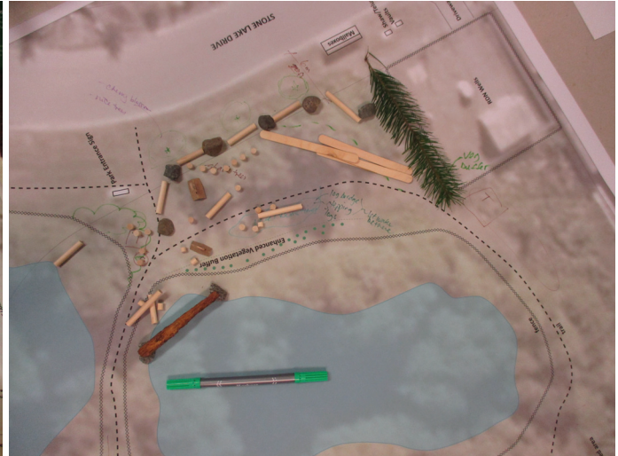
Adults model focusing near park entrance

Images posted up with natural play elements were also voted on. The elements that received the most votes are listed below. (Note, participants had the option to place multiple stickers on items they felt strongly about.)